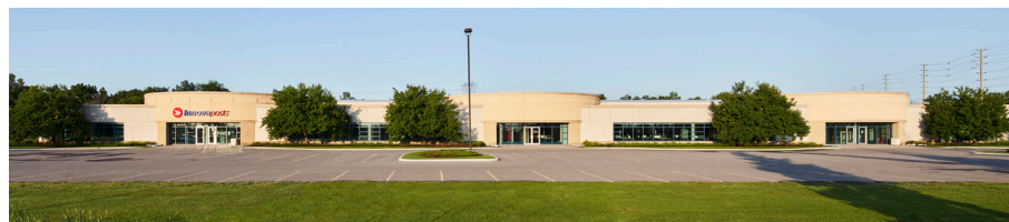
Exterior Front View