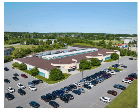
Exterior Aerial View

This document/communication has been prepared by Morguard Investments Limited ("MIL") for advertising and general information only. MIL makes no guarantees, representations, or warranties of any kind, expressed or implied, for the information including, but not limited to, warranties of content, accuracy, and reliability. Any interested party should undertake their own inquiries as to the accuracy of the information. MIL excludes all inferred or implied terms, conditions, and warranties arising out of this document as well as all liability for loss and damages arising therefrom. The information herein may change and any property described in the information may be withdrawn from the market at any time without notice or obligation to the recipient. This communication is not intended to cause or induce breach of an existing listing agreement. Morguard Investments Limited, Brokerage.