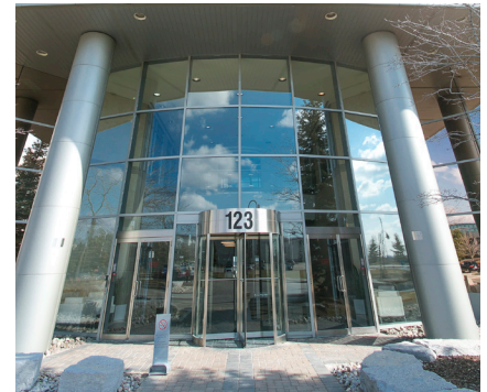
Exterior Front Entrance