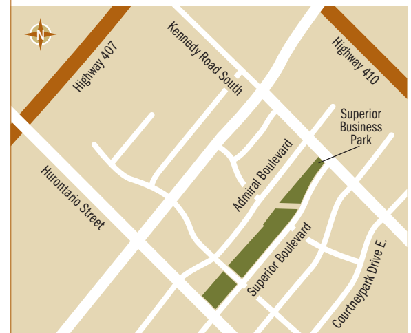
Map is not to scale