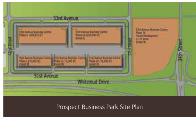
Prospect Business Park Site Plan