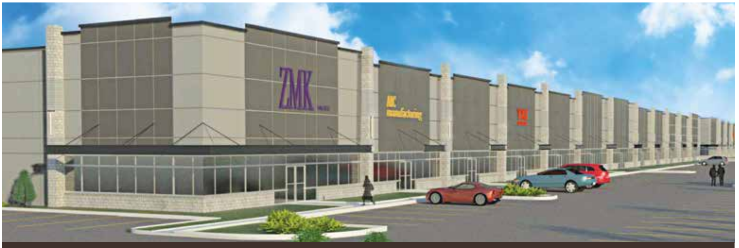
51st Avenue Business Centre Phase I – Rendering