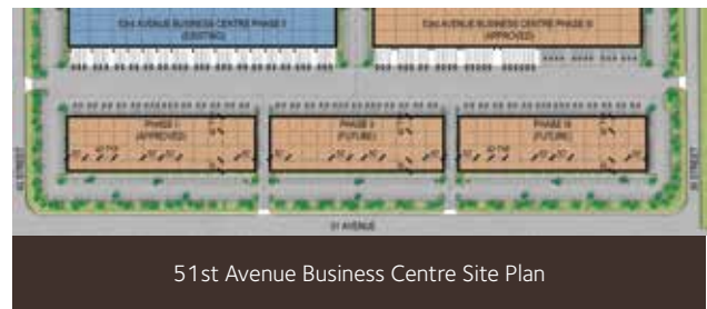
51st Avenue Business Centre Site Plan